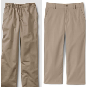
Example of approved pocket style below