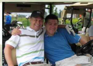
Grey Hawk Golf Club- 10th Hole

An excellent opportunity to play the course that Golf Digest ranked in the top ten of "America's Best New Affordable Public Courses"!