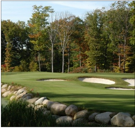
Grey Hawk Golf Club- 4th Hole

All proceeds raised at the Warrior Cup will benefit student scholarships to Christian Community School. Thank you for making a Christian education possible for these students.